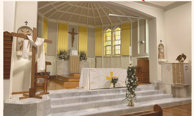
The beauty of the Easter Vigil