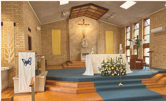
The joy of Easter morning