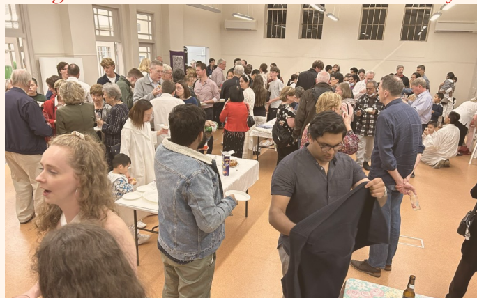
Continuing the celebration at the parish Easter Party after the Easter Vigil