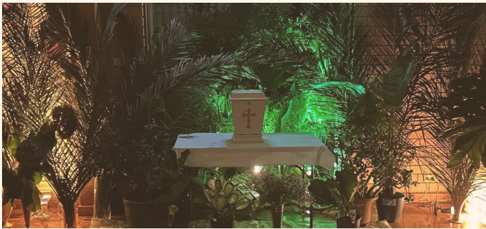
The Altar of Repose in the Garden of Gethsemane