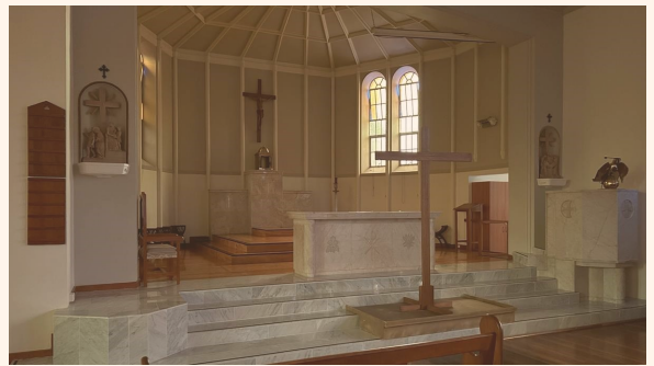
The starkness of Good Friday